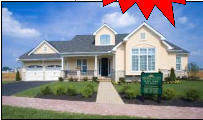
Lot #28, 628 Dorset St. Orange Blossom, Rancher

Original Price: $625,000 Address: 628 Dorset Street Lititz, PA 17543 Square Feet: 2,462 Bedrooms: 3 Baths: 3 Garage: 3 car attached Lot Size: .23 acres with large common area behind